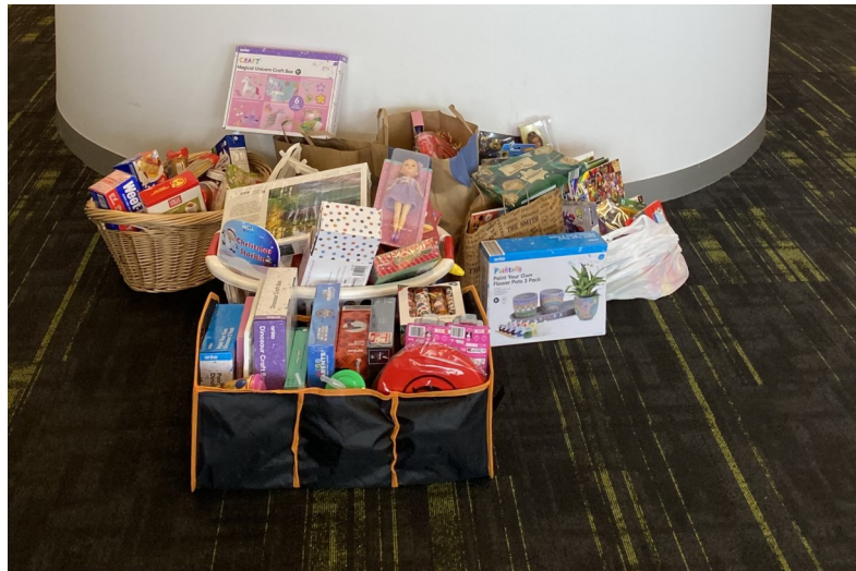
Above: Here are some of our donations at the Morwell Anglicare office.